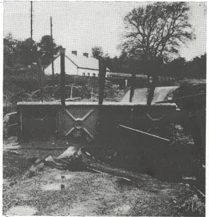
● Homes, villages and townlands are separated from their natural hinterlands by Britain's artificial partition of Ireland

The introduction of United Nations forces or European forces to supervise a British withdrawal or fill any alleged vacuum would only frustrate a settlement and must be avoided. Experience in other conflicts has