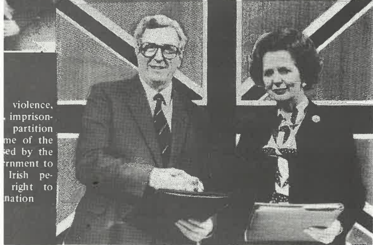
violence, imprison- partition me of the ed by the rnmnt to Irish pe- right to nation

to the Irish people of the right to exercise self-sovereignty, independence and national self-determination remain the only solution to the British colonial conflict in Ireland.